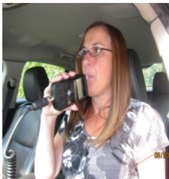
Proper Device Positioning