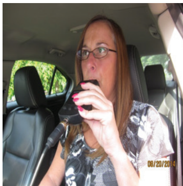
Improper Device Positioning

Step 5. Take a deep breath and blow steadily into the mouthpiece. You will immediately hear a continuous tone while blowing into the mouthpiece. If you do not, stop and try blowing a little harder. Once you hear the tone, continue blowing until you hear and feel a click in the handheld device. The LCD display will read: